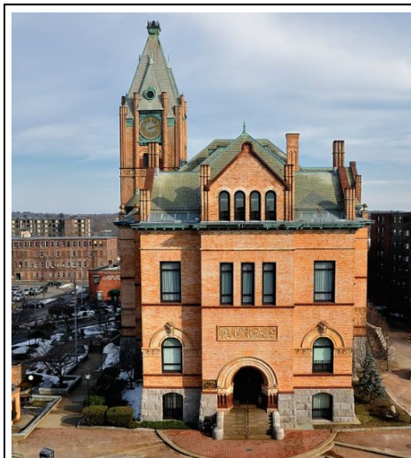
Brockton City Hall.

OCPF will assist candidates in the eight cities to set up in the new system. More information about joining the depository system is available at OCPF’s “getting started” page here .